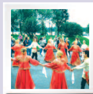
Russian Folklore Performance